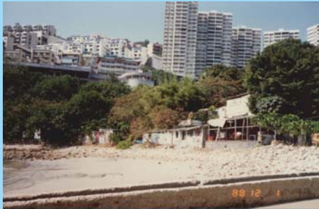
A noticeable drain directing polluted flow into the beach area was an eyesore