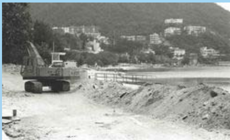
Improvement work to divert away polluted storm flow and improve beach environment